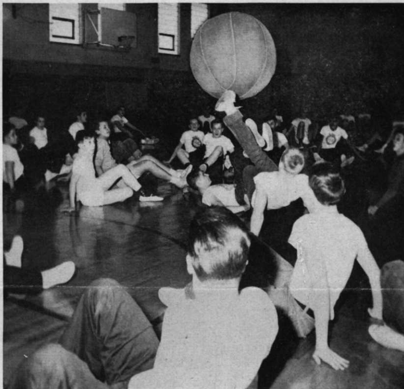
Action during the Frosh-Soph cageball game