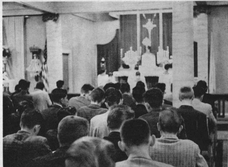
Students at prayer during Rosary Devotions