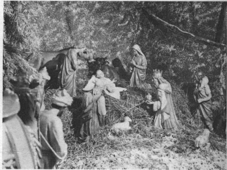
A picture of the manger scene in our Chapel

Music students have attended only one concert this year — the Corning Philharmonic Symphony Orchestra performing at Corning.