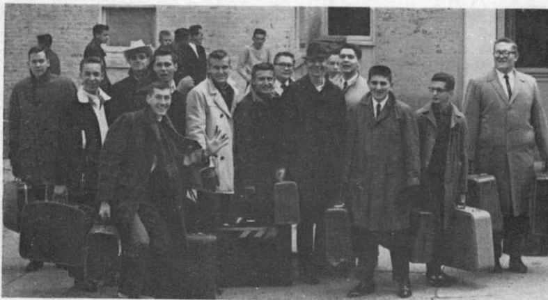
Seniors on the way out for their Thanksgiving vacation