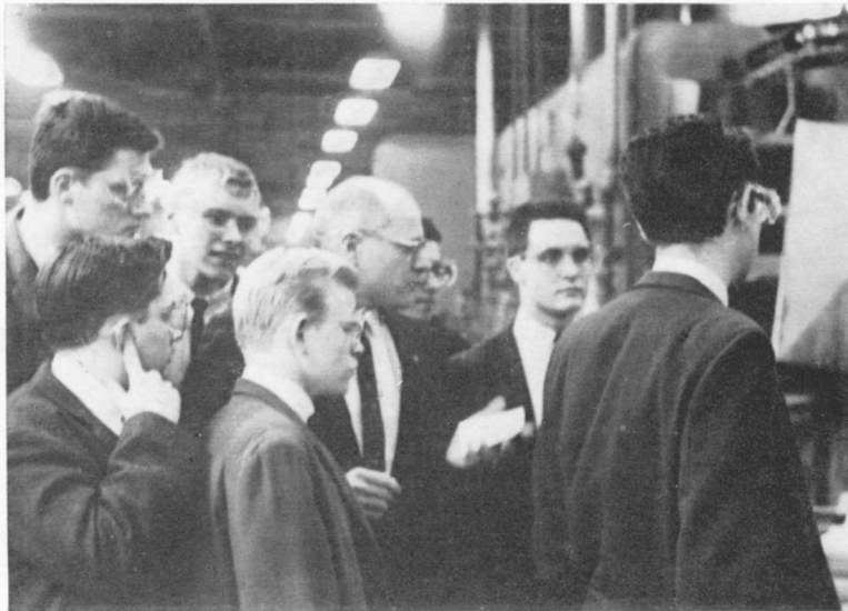
Seniors at the class tour of Eclipse-Bendix in Elmira, N. Y.