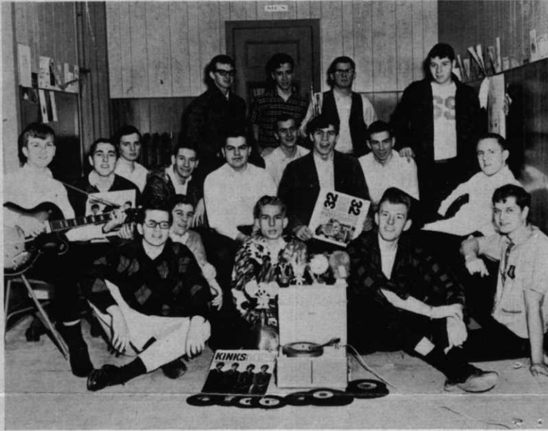
Senior class of 1966 spending a quiet afternoon in the dorms