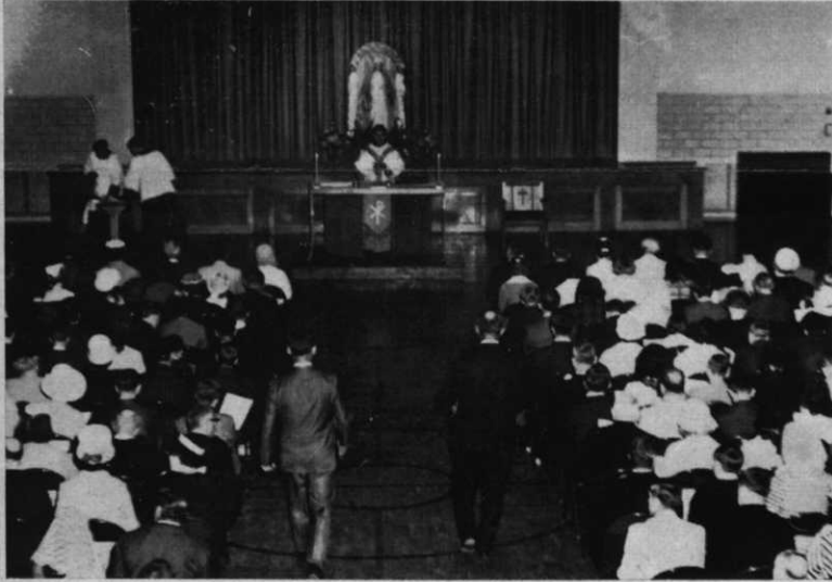
Rain kept the participants in the traditional procession inside the gym this Mother's Day