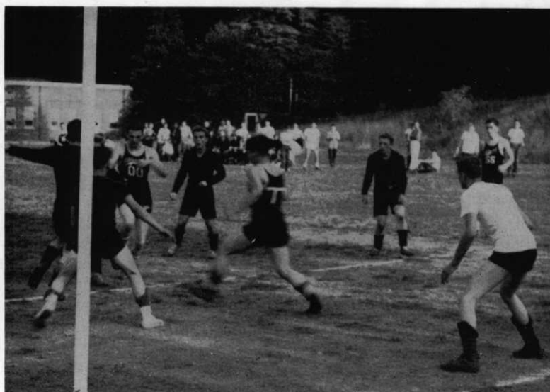
Cascaders Driving For a Goal