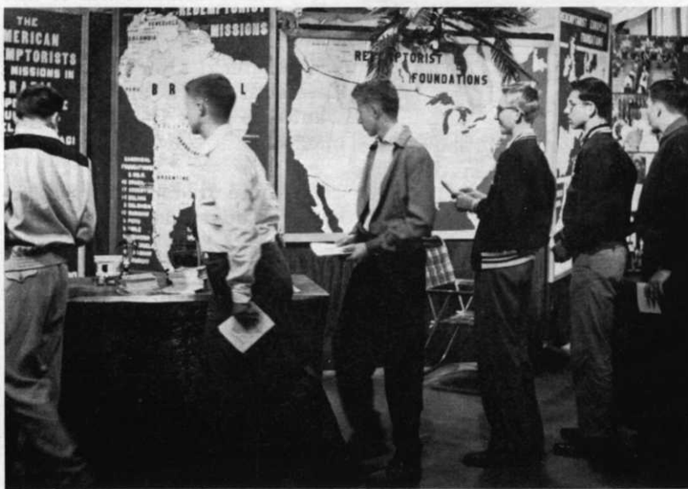
Paduans visiting exhibits at Scenerama