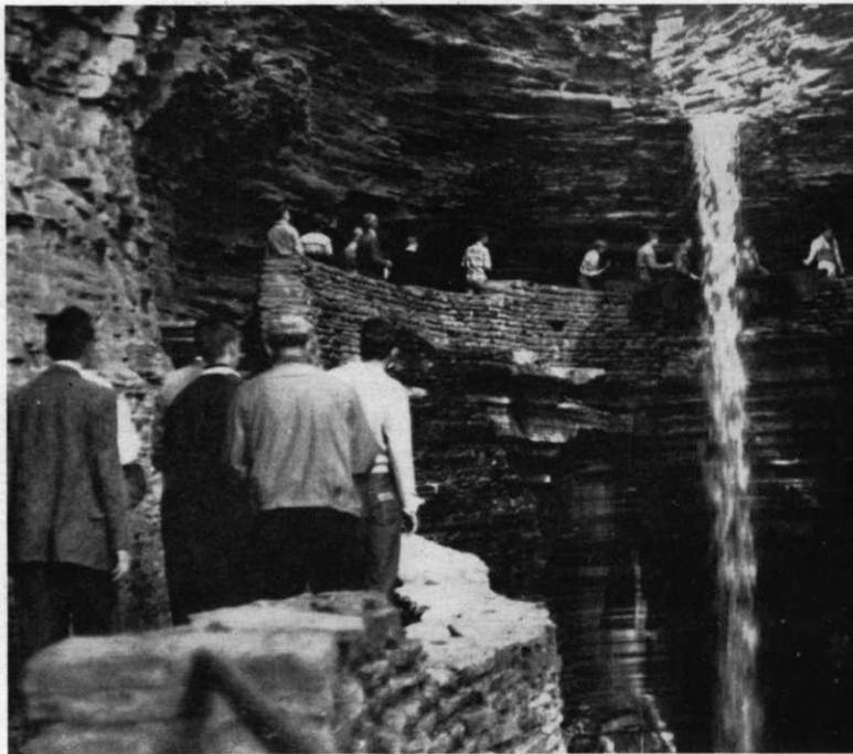
Freshmen on tour through the Glen