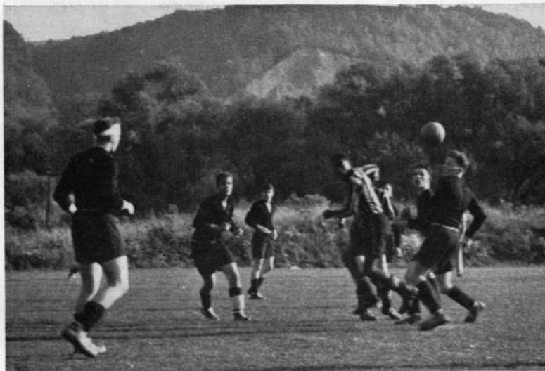
Cascaders battle it out with Hammondsport