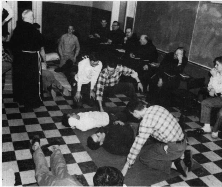
Faculty members observe seniors' first aid technique