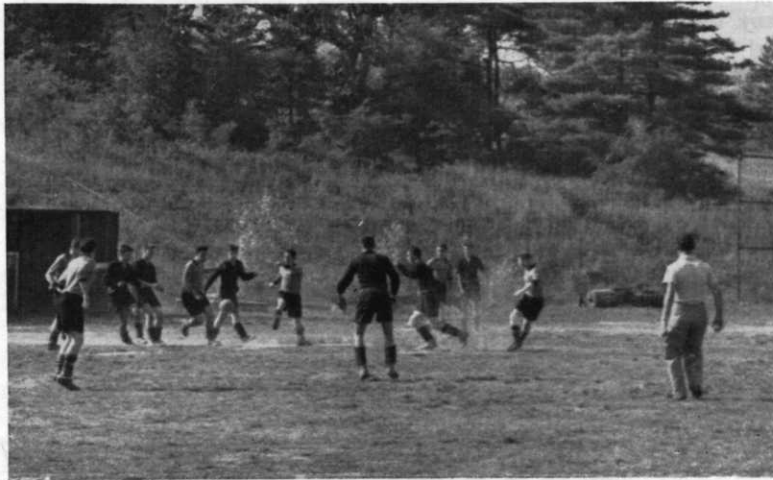
Spirited Action in the Padua-Nunda Game

only eleven men during the entire game, was also very satisfied with the results and commented after the game: 'This is the greatest team I've ever coached.'